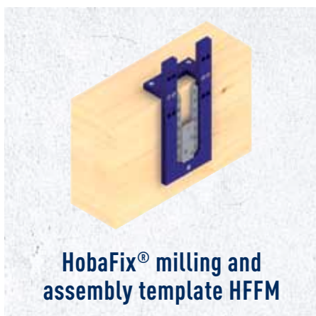
HobaFix ® milling and assembly template HFFM