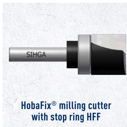
HobaFix ® milling cutter with stop ring HFF